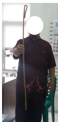
Fig. 1. Size of the lash used

As observed at the Wilayatul Hisbah office, the lash used is not too thick and not too hard as to limit the pain inflicted, as displayed in Fig.1 below.